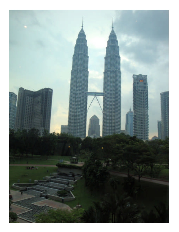
Twin Towers next to the KL Conference Centre